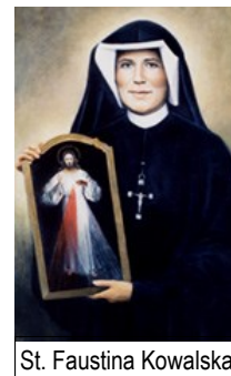
St. Faustina Kowalska

"I want to be completely transformed into Your mercy and to be Your living reflection, O Lord. May the greatest of all divine attributes, that of Your unfathomable mercy, pass through my heart and soul to my neighbor. Help me, O Lord, that my eyes may be merciful, so that I may never suspect or judge from appearances, but look for what is beautiful in my neighbors' souls and come to their rescue. Help me, that my ears may be merciful, so that I may give heed to my neighbors' needs and not be indifferent to their pains and moanings. Help me, O Lord, that my tongue may be merciful, so that I should never speak negatively of my neighbor, but have a word of comfort and forgiveness for all . . . May your mercy, O Lord, rest upon me."